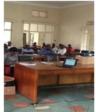
Public hearing in Moroto District.

The main purpose of the consultations was to; present the applications to the affected people for their appreciation and comments, to consultate the public on electricity issues and get feedback on issues that should be addressed by UEDCL. The local residents were assured that UEDCL will work in partnership with Rural electrification agency (REA) to bring electricity close to them. The attendance was good for the public hearings and the local residents seemed to be appreciative of the UEDCL initiative.