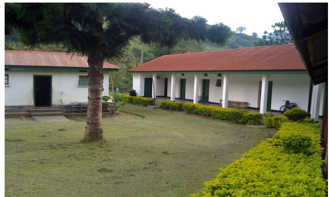
The newly painted block at the Kilembe mine hospital