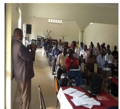
Public hearing in Dokolo

cence application, ERA held public consultations in these areas, on 12 th , 14 th , 16 th and 18 th November 2013.