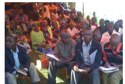
Local residents at ECO Power holding Public hearing

On 23 rd November 2013, ERA held another public hearing in regards to Eco Power Holdings application for a license for the generation and sale of 5.54 MW of electricity from a hydro plant planned to be established across River Rwimi in Kihoko, Nyakabale, Nyaseke and Rugendabara villages, Kitwamba sub-county in Kasese District. This time we got the location right!