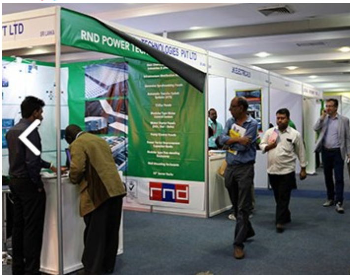
Exhibitors during last years exhibition in Nairobi.

A n International Electricity & Power Expo has been organized between the 24 th to 26 th November 2017. The exhibition will be held at Sarit Expo Centre, Nairobi, Kenya.