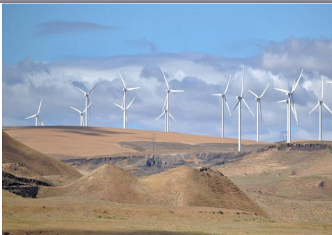
The GANSU WIND FARM located in China.

The largest wind farm in the World " GANSU WIND FARM " is located in China, with a power generation capacity of 6,000 MW. The Farm is expected to produce 20,000 MW by 2020.