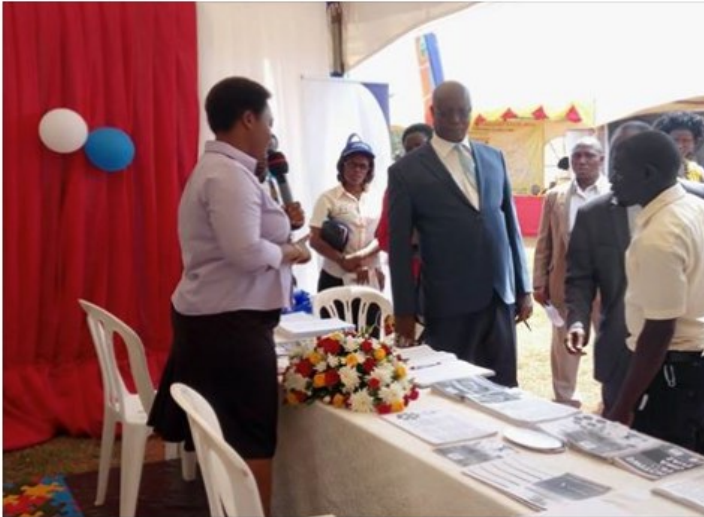
The Minister of State for Energy, Hon. Simon D'Ujanga at the ERA stall.

Stakeholders who attended the 2017 Energy Week at Lugogo KCCA Grounds, applauded ERA for the commitment towards transforming Uganda's Electricity Supply Industry (ESI), to efficiency.