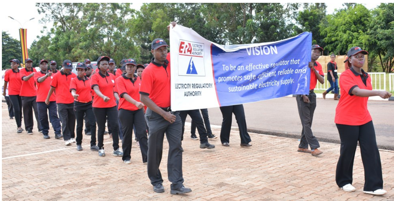
The ERA team at the Uganda 52 nd Independence Anniversary celebrations at Kololo Ceremonial Grounds.

The Board, Management and Staff of ERA congratulate H.E the President of the Republic of Uganda, Gen. Yoweri Kaguta Museveni and the people of Uganda on the 52 nd Independence Anniversary.