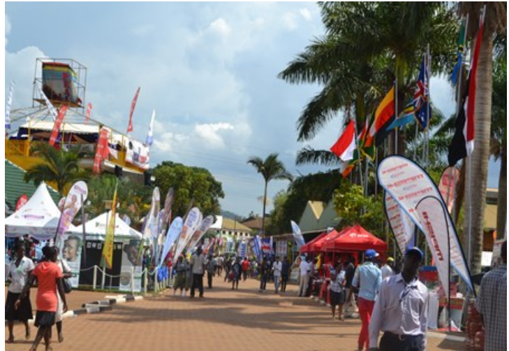
Patrons that turned up for the Trade Fair at UMA show grounds, Lugogo.

UGITF is a multi-sector annual trade fair, that has in the past 21 years offered great opportunities for 'one to one' interactions, technology transfers and networking platform within East and Central Africa.